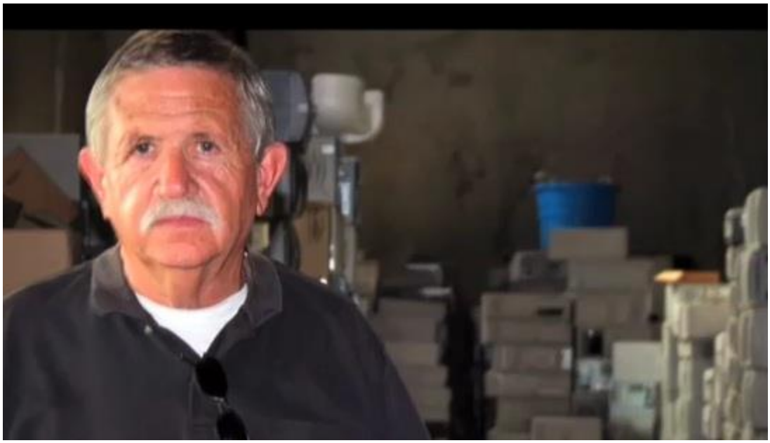
By Kate McLean Posted September 10, 2009 6:00 am

On a hot day in West Oakland, children and parents sat at rows of desks in a warehouse classroom. It was dark, the fan hummed and people chattered in low voices. A sense of expectation filled the room.