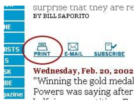
A Web page with Print format

You will feel like a real computer pro in no time when you learn many of the tricks of the trade. One very helpful trick is the print-friendly option found on so many Web pages. This printing choice gives you a printed copy of the page or article that omits many of the graphics and fancy formatting. A text-only version will be printed for you simply by selecting the printer-friendly version.