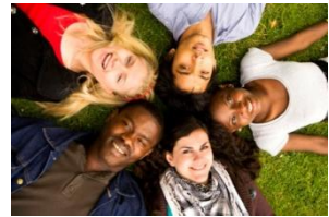
Minority Student Enrollment in Baccalaureate/Transfer and Career & Technical Education Programs, FY 2010