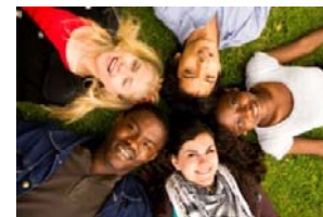
Minority Student Enrollment in Baccalaureate/Transfer and Career & Technical Education Programs, FY 2009