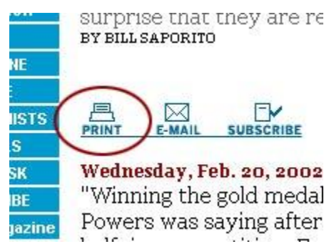
A Web page with Print format

You will feel like a real computer pro in no time when you learn many of the tricks of the trade. One very helpful trick is the print-friendly option found on so many Web pages. This printing choice gives you a printed copy of the page or article that omits many of the graphics and fancy formatting. A text-only version will be printed for you simply by selecting the printer-friendly version.